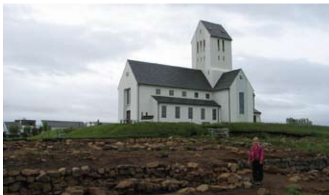
Skálholt, South Iceland.