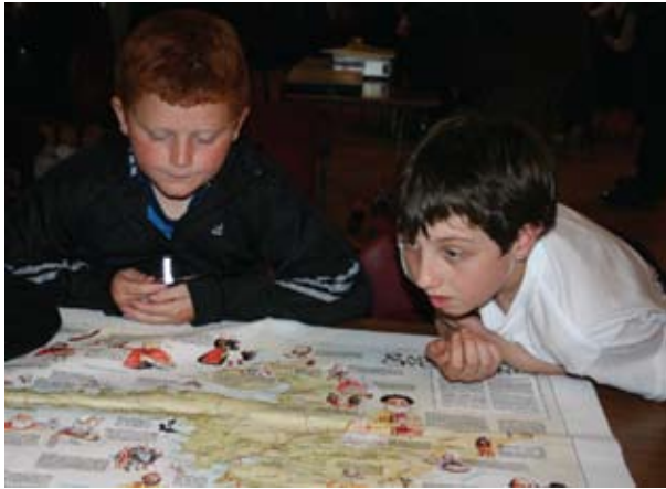
Students contribute their ideas for the Outer-Hebrides Heritage Map.

Cultural Heritage Maps and Vocational Training is a two year project that started in October 2007. The main goal of the project is to pass on the work and knowledge from the applicant organisation Rannsóknir og ráðgjöf ferðapjónustunnar / Tourism Research & Consulting in preparing, developing and using history and heritage maps to support vocational training of guides, reception and museum staff and with it strengthen heritage tourism in the partners areas and countries. The maps will also be useful for local inhabitants, teachers and their students to raise awareness of their local heritage. All the partners will make, use and promote a heritage map of their area. The themes of the maps will vary from partner to partner. The illustrator and graphic designer of the maps is Ingólfur Björgvinsson and the main photographer is Frank Bradford (back of the maps).